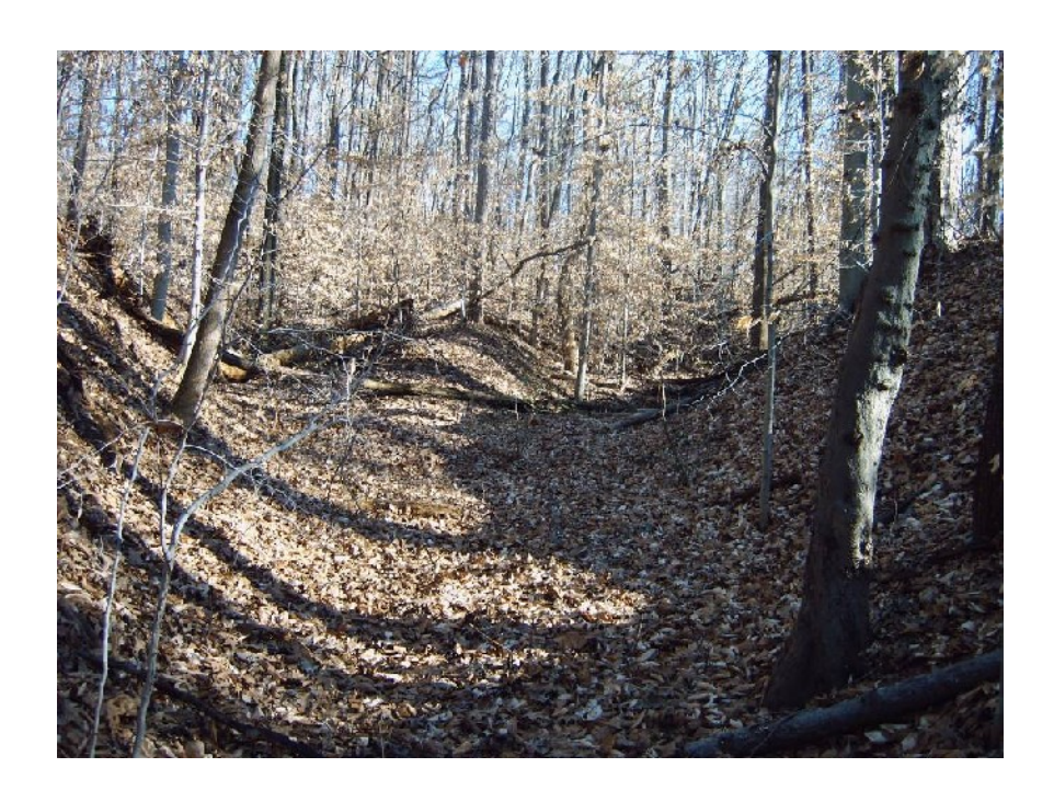
Converging roads at south approach to Trading Ford, view south.