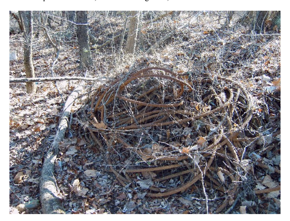
Large loose coil of 1" dia. braided steel ferry cable 85' east of Trading Ford.