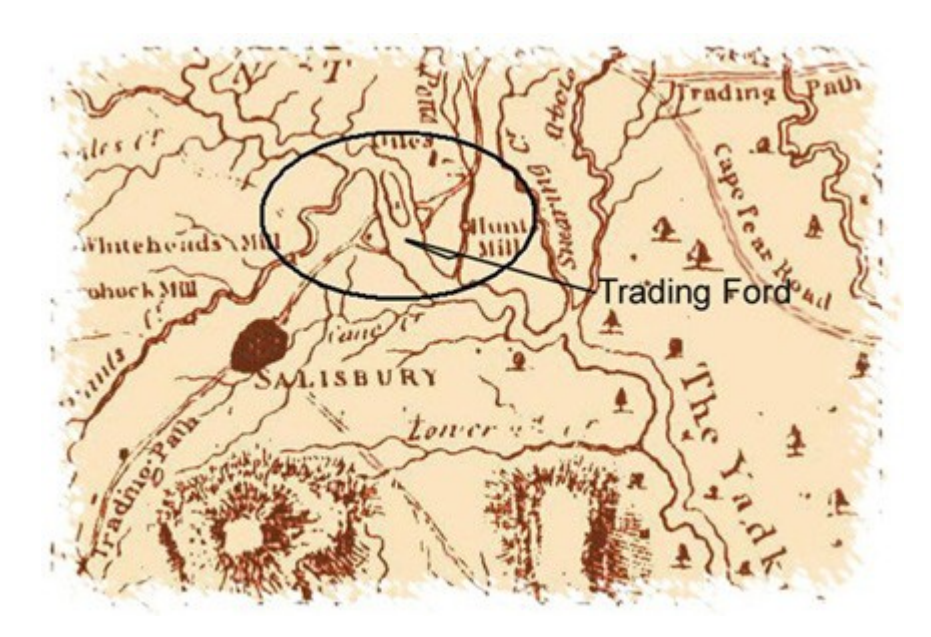
The Collett map of 1770 showed the "Old Indian Trading Ford" crossing the island in the Yadkin River, and the Colonial Trading Ford crossing below the island.

The Trading Ford was the place where "the Trading Path from Fort Henry (Petersburg), Virginia to the Catawbas and Waxhaws" crossed the Yadkin River. It was so-named because of its use by traders from Virginia who bartered with Native peoples in North Carolina. Its origins are lost in antiquity. Scholars believe the Spanish built a fort in the Trading Ford area in 1567, and the journals of early explorers document the ford in 1670, 1674, and 1701. As the Piedmont became settled by Europeans, it became the Yadkin River's major ford. Approach roads on Duke Energy's property remain, some leading south, some east. These historic roads or "traces" are large gullies, cut into the land by the thousands of wagons which passed over it. Nearby is a historic spring, and a historic spring-fed pond, with the remains of a sluice gate. A large loose coil of 1" diameter braided steel cable appears to be the ferry cable, a rare find. In all likelihood, we've only begun to scratch the surface in identifying historic resources at this historic ford.