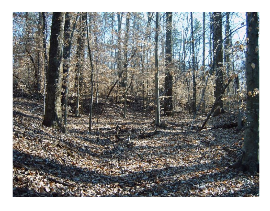
Multiple roads at south approach to Trading Ford, view south.