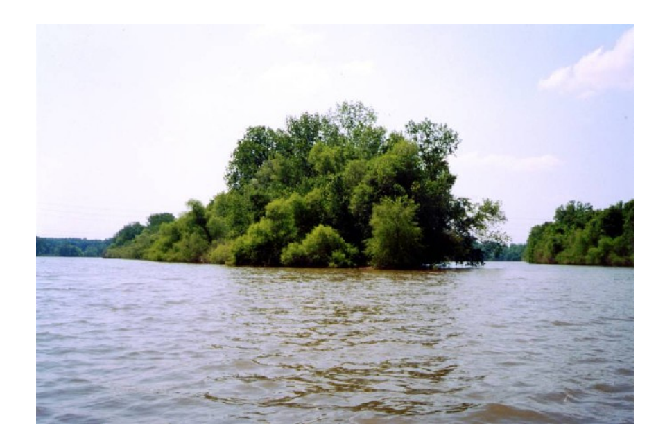
Photo of downriver tip of Big Island where Trading Ford crossed the Yadkin River, view west.