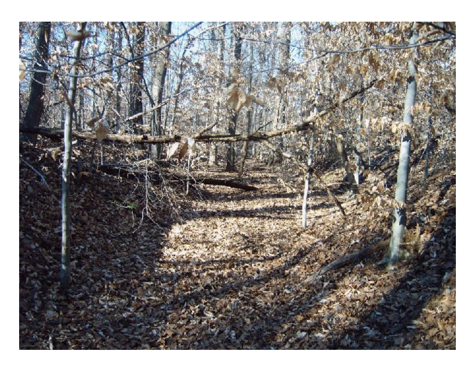
One of the roads south of the Trading Ford, view south.