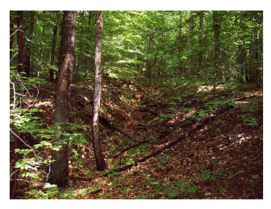
Road parallel to river, east of Trading Ford, view east.