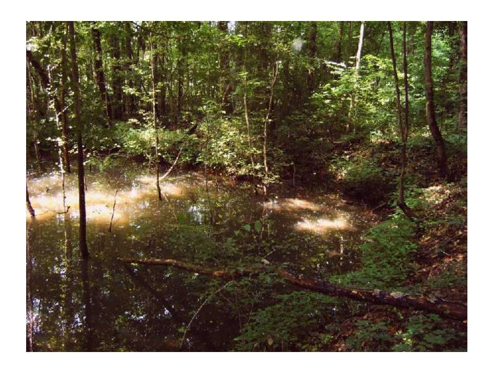
Spring-fed pond east of Trading Ford, view south.